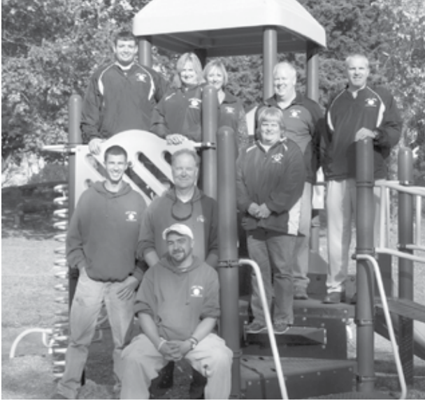
Parks & Recreation Department Staff