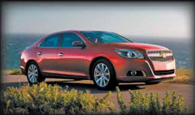
2013 CHEVROLET MALIBU