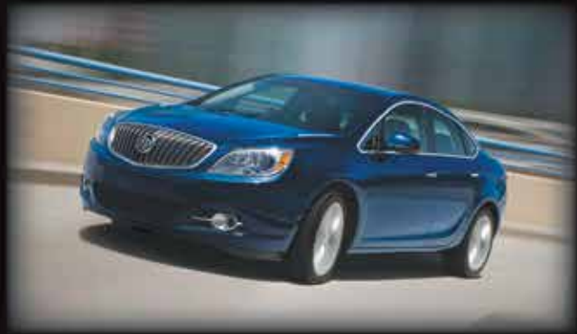
2013 BUICK VERANO