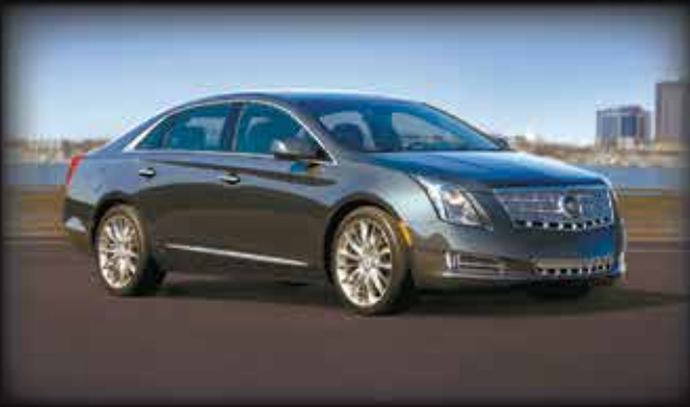
2013 CADILLAC XTS