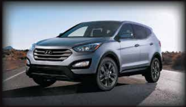
2013 HYUNDAI SANTA FE